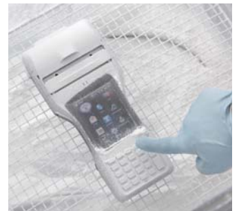
Dust proof test