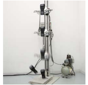
Drop durability test

*Water splashed against the device from any direction has no harmful effects when all covers for connectors, etc. are closed.