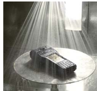
Water-splash proof test